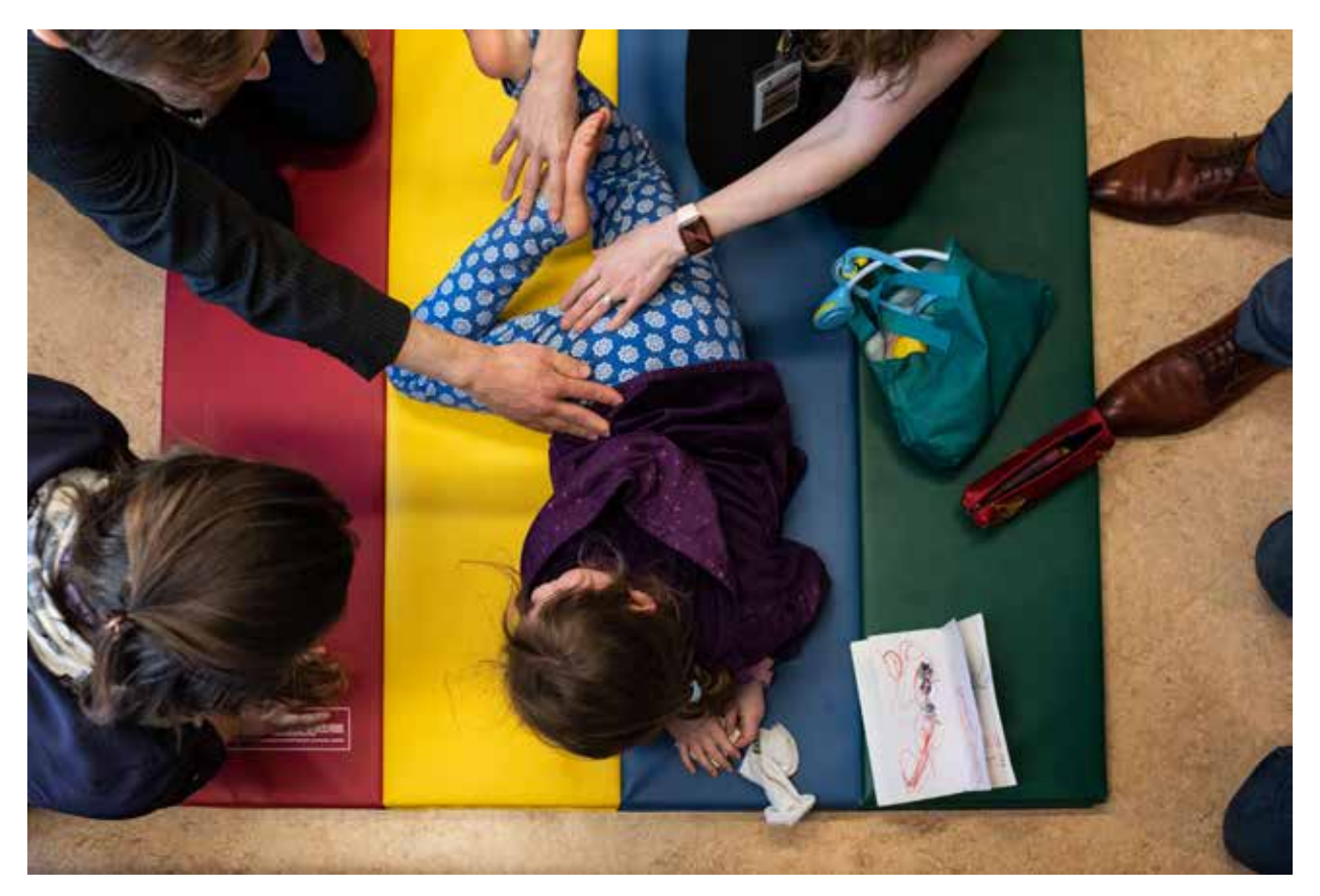
Multiple specialists assess a young girl's hip mobility during a day of appointments.

"We can't work. We can't contribute to a pension plan. We can't get a mortgage. We can't save any money," she points out. "We are unpaid caregivers, and therefore our ability to work is severely limited. We represent an extremely vulnerable population. No one recognizes our level of distress and suffering."