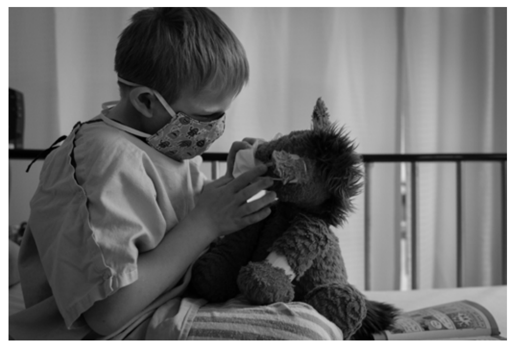
During the pandemic, a young boy in a mask prepares his stuffed horse for dental surgery.

"One of the central issues emphasized by the Committee was the need for a child and family-centered model of care that recognizes each child's and each family's unique circumstances, and works with families to determine and provide appropriate, wrap-around supports and services." <sup>47</sup>